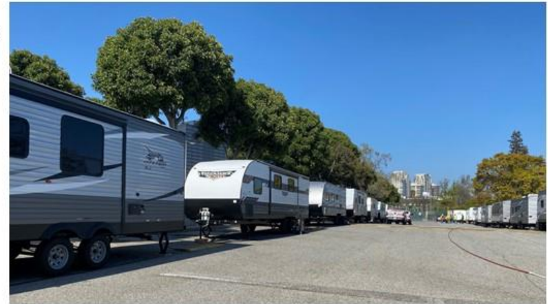
Trailers with water and power at Westwood Recreation Complex during Covid-19.